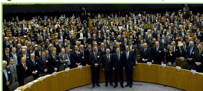
First Covenant of Mayors Signature Ceremony at the European Parliament, Brussels, Belgium (10 th February 2009)